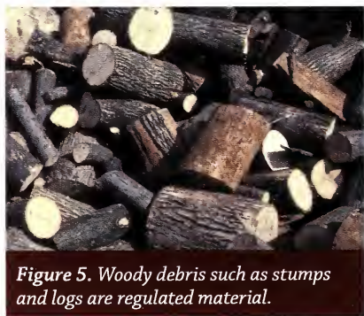
Figure 5. Woody debris such as stumps and logs are regulated material.

The Federal and State laws that establish regulated areas around ALB infestations outline the conditions and requirements for moving regulated articles out of or within those areas. The Massachusetts Department of Conservation and Recreation issued the Massachusetts quarantine order in compliance with sections 8, 11, and 12 of Chapter 132 and section 1F of Chapter 132A of the Massachusetts General Laws. APHIS issued a Federal Order that mirrors the regulated boundaries of the State in fall 2008.